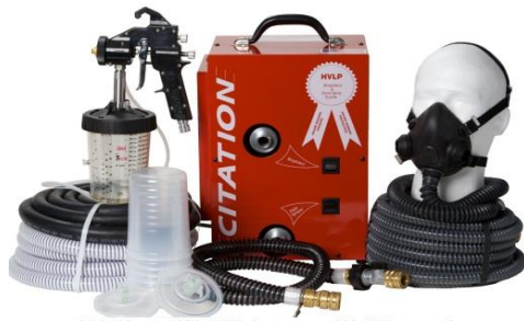
Unit Shown With PPS System and Half Facemask