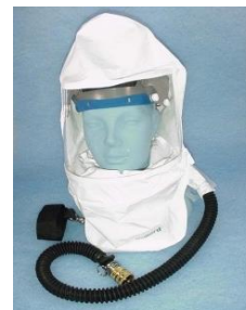
HD01 Air Supplied Painting Hood