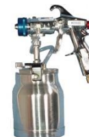
Lex Aire Pro Series Bottom Feed