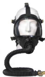
FF01 Full Facemask