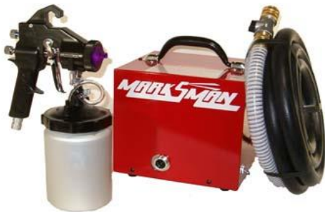
Marksman HVLP Paint Sprayer shown with 3M gun

The MARKSMAN is especially designed for, but certainly not limited to the woodwork refinishing and modeling market.