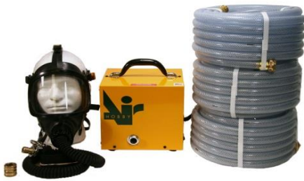
Hobbyair 120 shown with Full Facemask

You can choose a Hobbyair with 40, 80, 120, or 160 feet of hose.