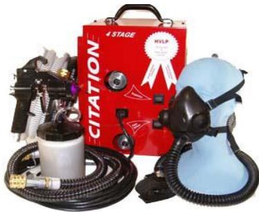
Citation HVLP Paint Sprayer/Respirator System

Choose the Best System for Your Application