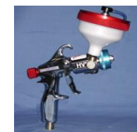
Lex Aire LP Low Profile Gun