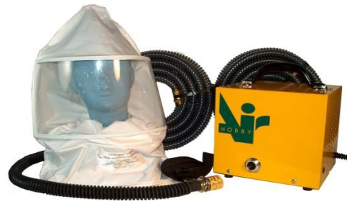
Shown with Air Supplied Hood & 21041 Hoses