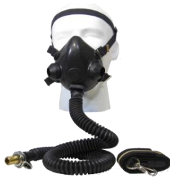
HF01 Half Facemask