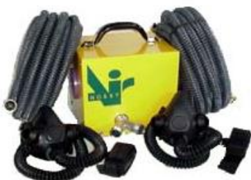
Shown with Half Facemasks & 21041 Hose