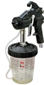
Pictured with 3M Bottom feed Gun

The 3M PPS Cups system will work with Lex Aire or any other bottom feed pressurized spray gun