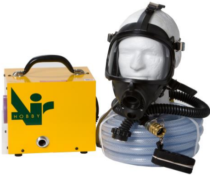
Shown with Full Facemask & 21040 Hose