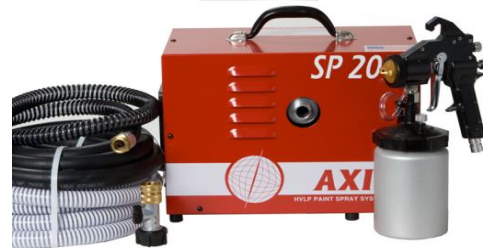
Axis HVLP Paint Sprayer

All of our HVLP sprayers include a standard professional quality HVLP spray gun made by Lex Aire or 3M/Accuspray for dependable finish results.